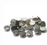
工字扣 Jeans Buttons