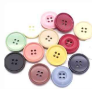
树脂纽扣 Polyester Button

更多产品请关注我们官方网站。 Please visit our official website for more products.