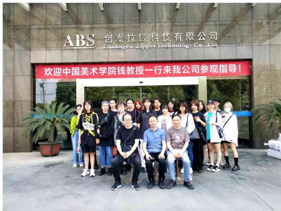
我们与中国美术学院成立设计研发团队 Establishing a Design and Development Team with China Academy of Art.

Design and Research&Development(R&D) and Patents