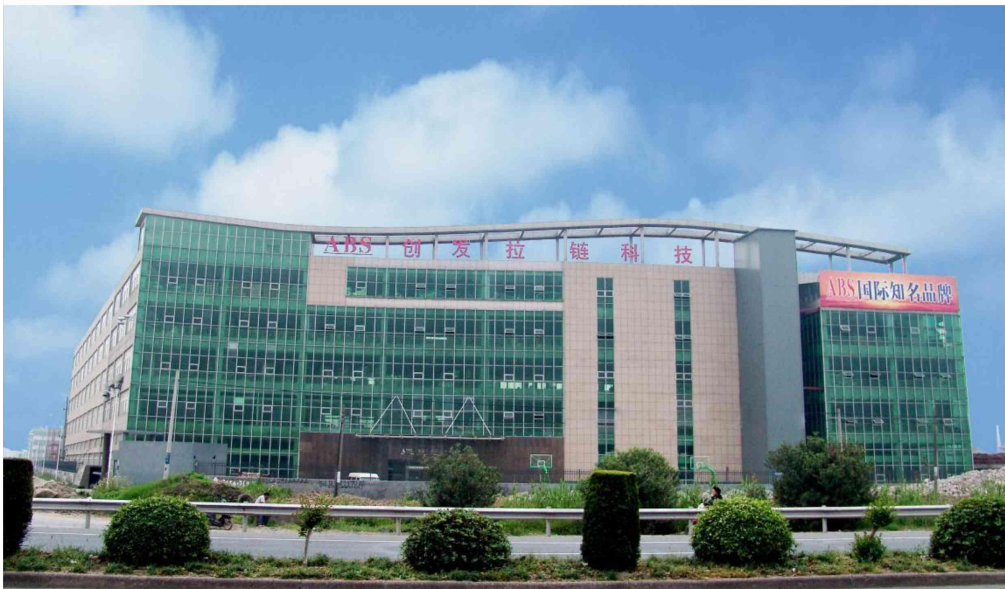
总部大楼 Headquarters Building