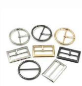
锌合金三档扣 Zinc alloy third gear buckle