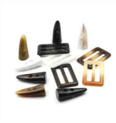
牛角尖/档扣 Horn tip/Gear buckle