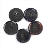
天然牛角扣 Natural cowhorn buckle