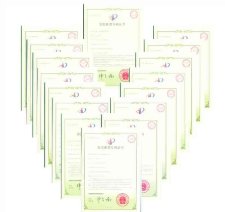
公司专利证书 Company Patent Certificate.