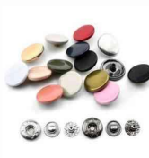
四合扣 Snap Button