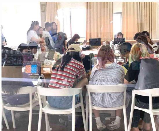
我们与浙江理工大学成立研发设计团队 Establishing a Design and Development Team with Zhejiang Sci-Tech University.