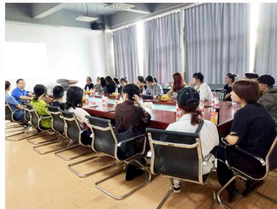
ABS设计团队与中国美术学院一起探讨新产品设计方案 Team of ABS Exploring Design Solutions for New Products with China Academy of Art.