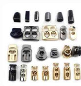
吊钟/绳扣 Hanging Bell/cord Lock