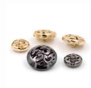
锌合金手缝扣 Zinc alloy hand sewn buckle